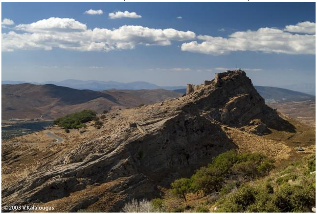
Castello Rosso (Kokkinokastro, "The Red Castle")

4 km from the center of Karystos, between Grampia and Myloi villages, Kokkinokastro dominates through its robust presence. Its name is due to the red stones with which it was built and the Latins used to call it Castello Rosso ("The Red Castle").